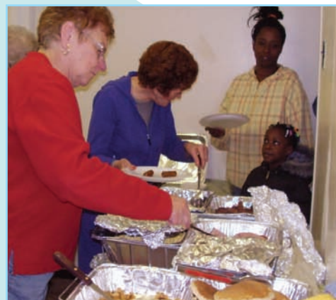
Members of St. Margaret Mary's Parish serve hot breakfast foods to clients eager for brunch.

We are grateful to Connelly Foundation and Claneil Foundation for generously funding Bernardine Center Programs and to United Way of Southeast Delaware County for assisting BC to receive food funding through the Emergency Food and Shelter Program.