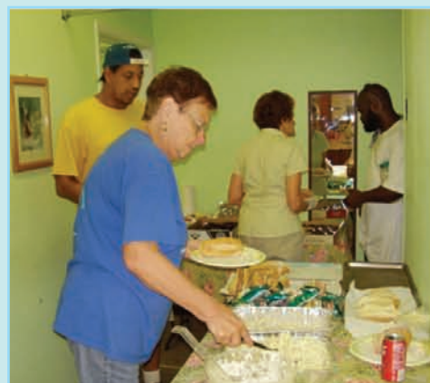
Members of St. Mary Margaret's take turns dishing out a meal for clients.