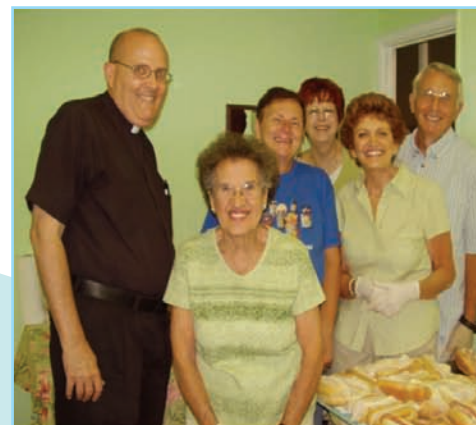
Members of St. Mary Margaret's Social Committee pose while waiting for brunch to begin.