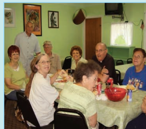
Members of St. Mary Margaret's gather for a chatty lunch after serving the clients their meal.