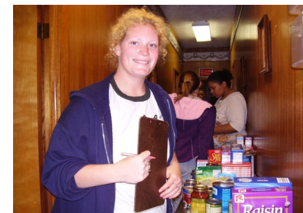
Bernardine Center volunteers gather food items, based on clients' menu requests, during a Food Pantry distribution session.

The Bernardine Center provides a helping hand to low-income Chester area residents by distributing emergency and supplemental food and supplies. It also provides educational programs to help clients build better lives for themselves, their families, and their communities.