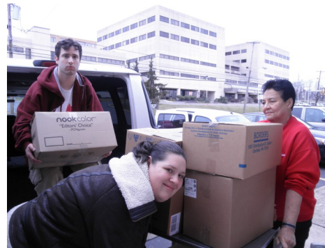
Staff and volunteers unload boxes of donated food from the "Souper Bowl" collection.

Community Garden - The nearby Senior Center and four individuals rented six of BC's eight raised beds to grow and harvest their own produce during the garden's second bountiful season. The Center's own six raised beds behind the building, as well as the remaining two in the Community Garden, produced enough cucumbers, tomatoes, peppers and squash to provide fresh veggies during West Side Brunch.