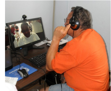
Client uses Skype while practicing computer skills

Partnerships to Enhance Services: BernardineFranciscanSisters provide support and funds for the Center. Elwyn's Education Division of Transition- Aged Students with Special Needs offers service in our Food Pantry and prepares individual meals for distribution to families in need.